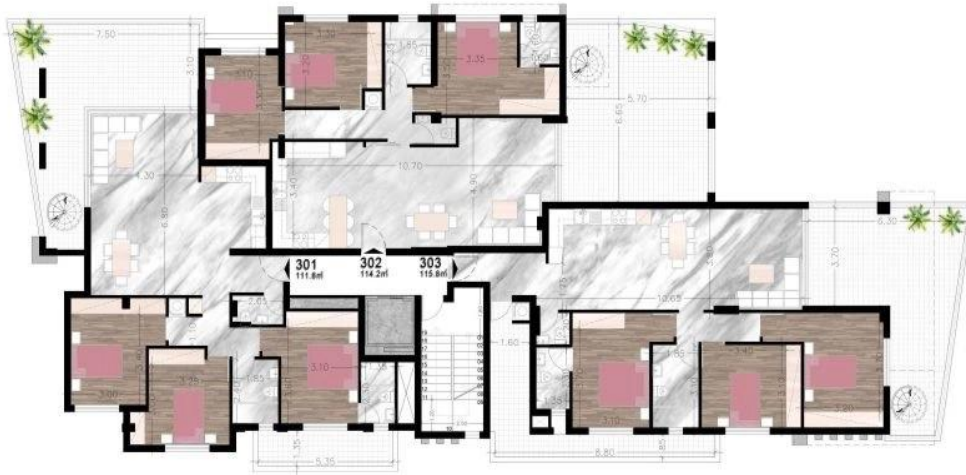
3rd FLOOR PLAN