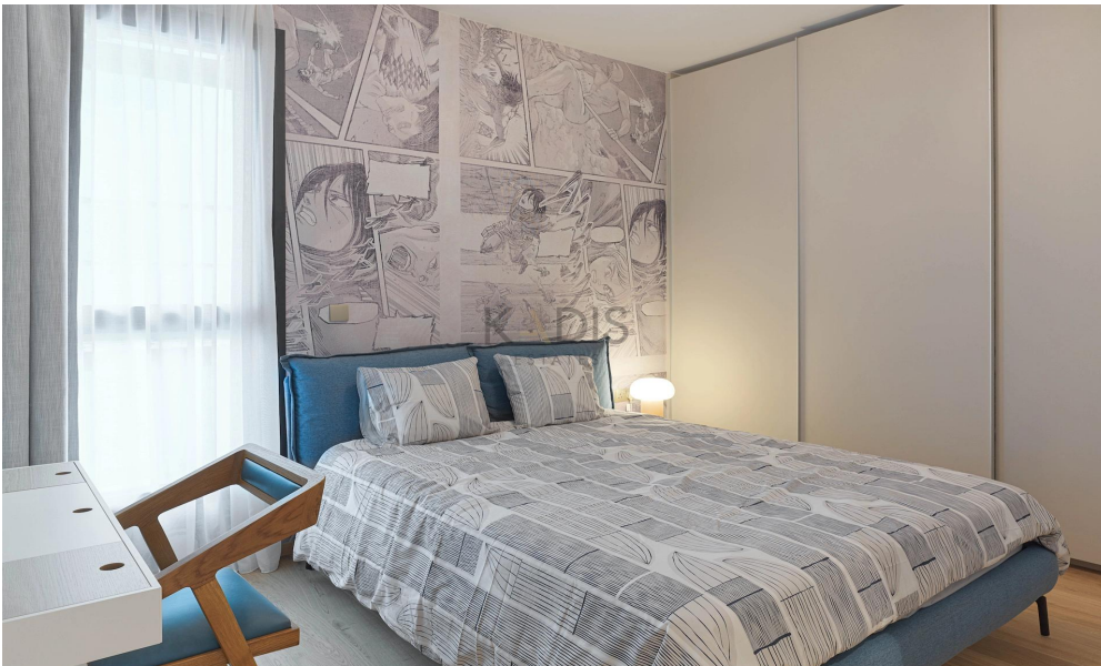
Typical Floors 1- 4