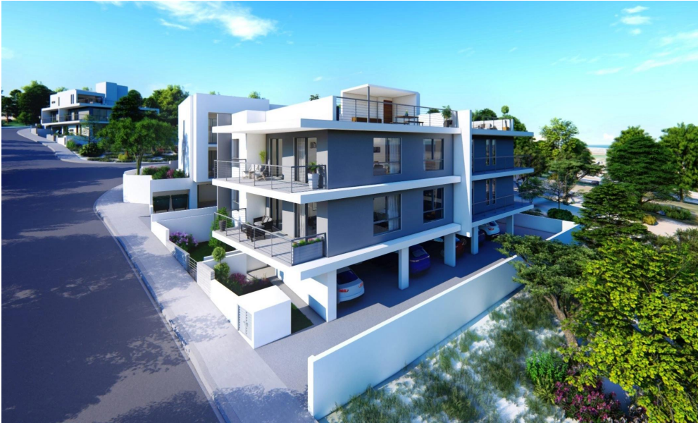
PETRIDIA E - IN PLOT 589 NEW - (OLD No.4) / APARTMENTS 101 / 102