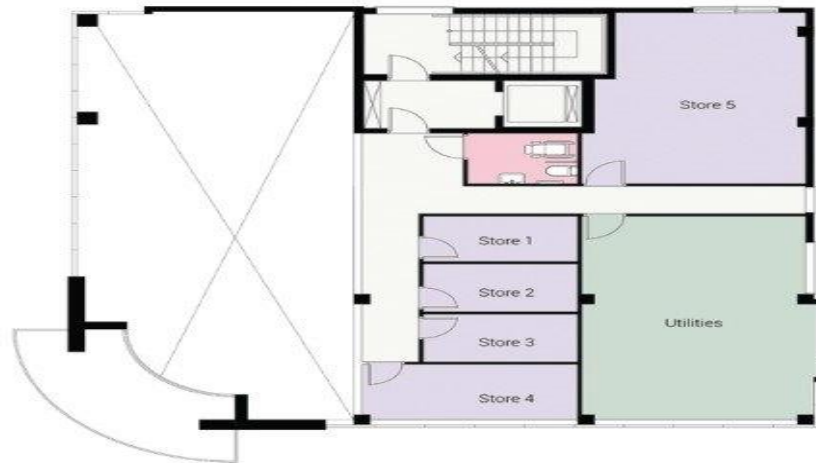
Mid Level Floor