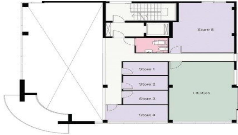
■ Mid Level Floor