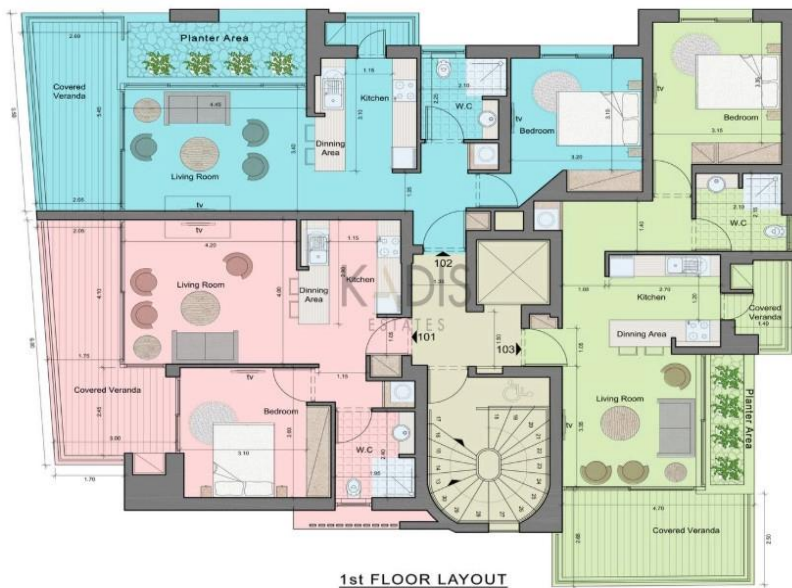
1st FLOOR LAYOUT