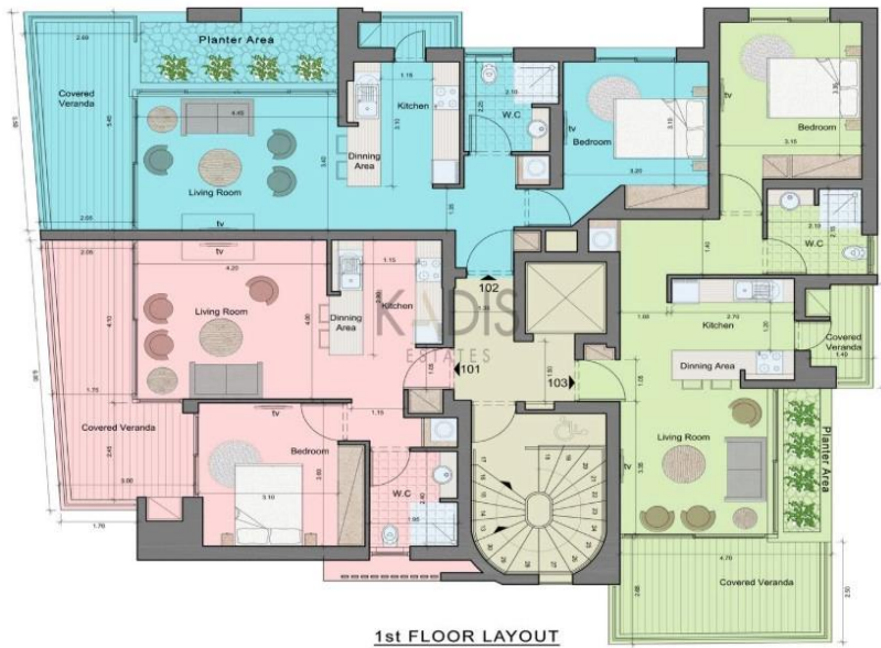
1st FLOOR LAYOUT