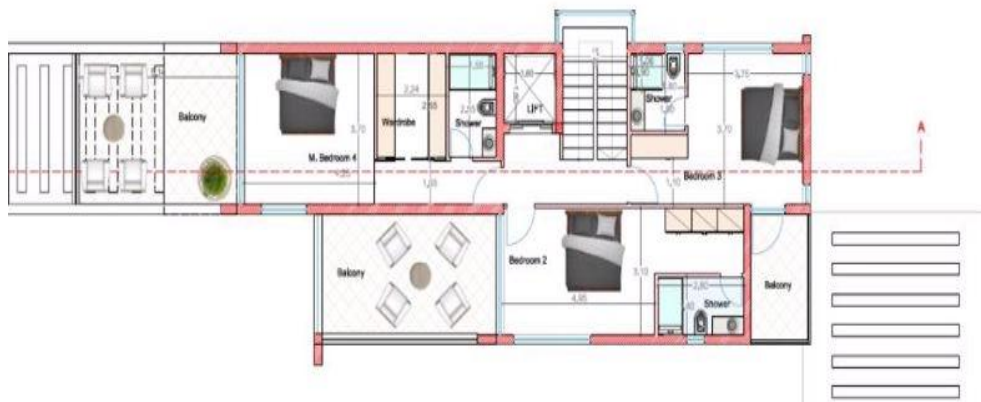
Villa No. 4 First floor with 3 en-suite bedrooms