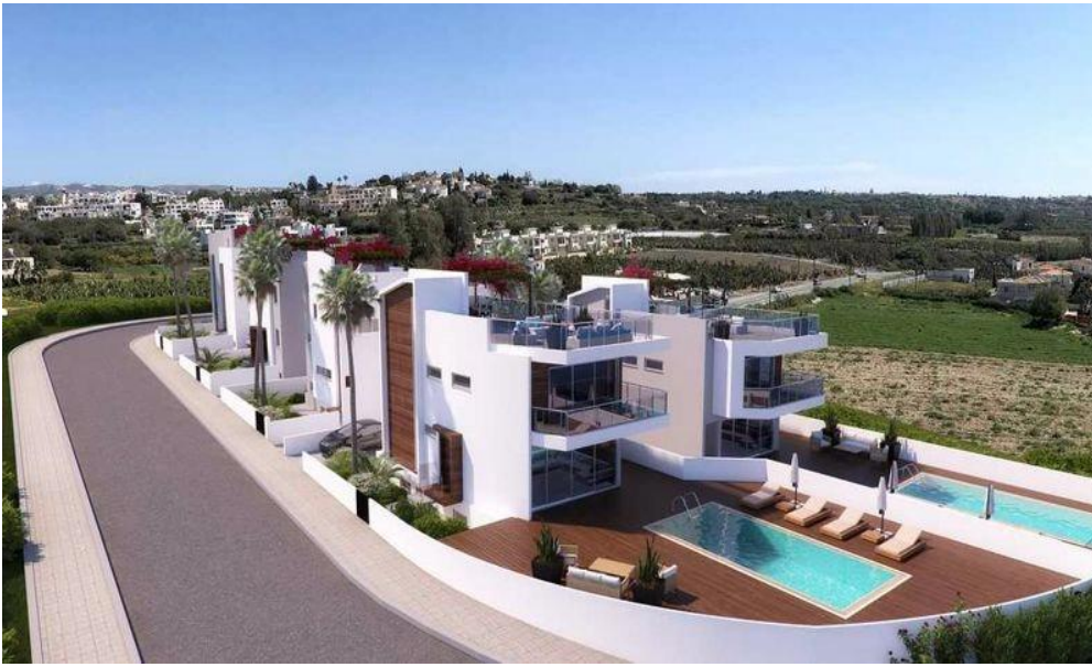
Optional semi-basement area