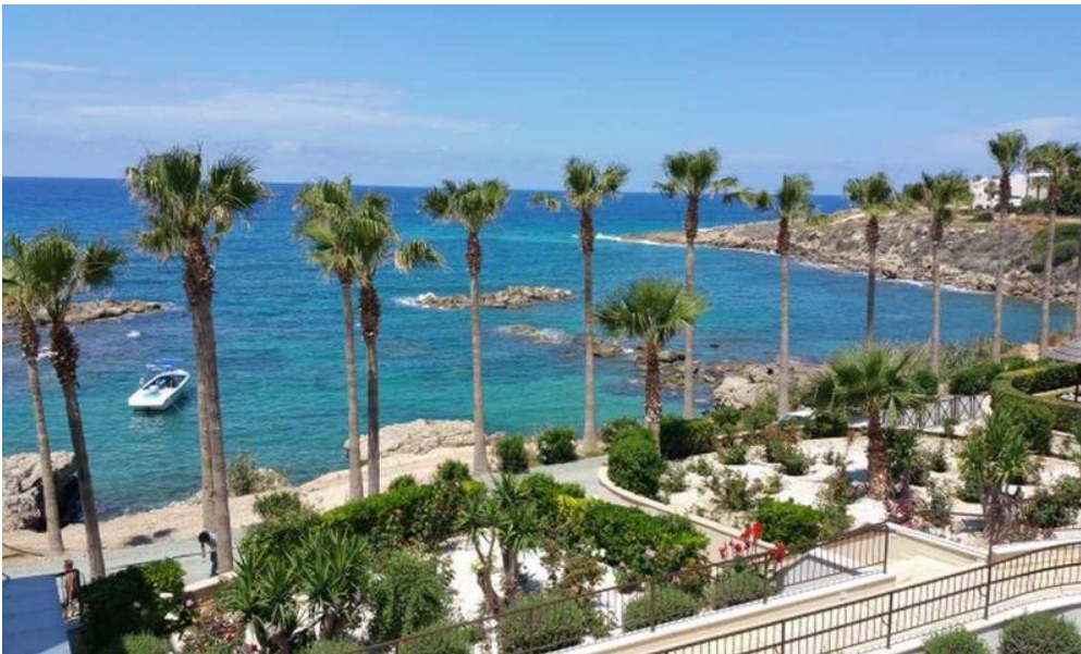
Villa No. 4

Ground floor – garden, pool, kitchen, dining room area & en-suite bedroom