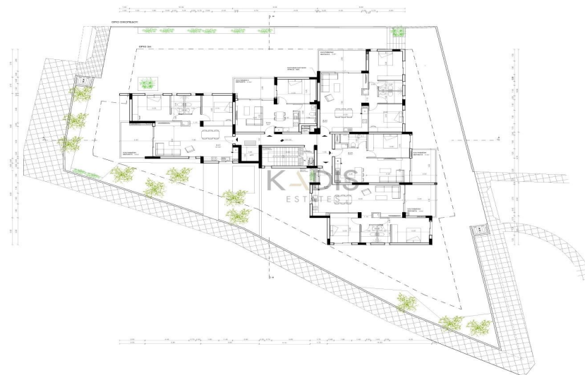
ΚΑΤΩΦΗ 2ου ΟΡΟΦΟΥ