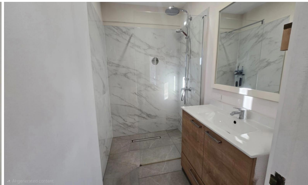
1 onó 1 - Αιόψαρο Κορυφ