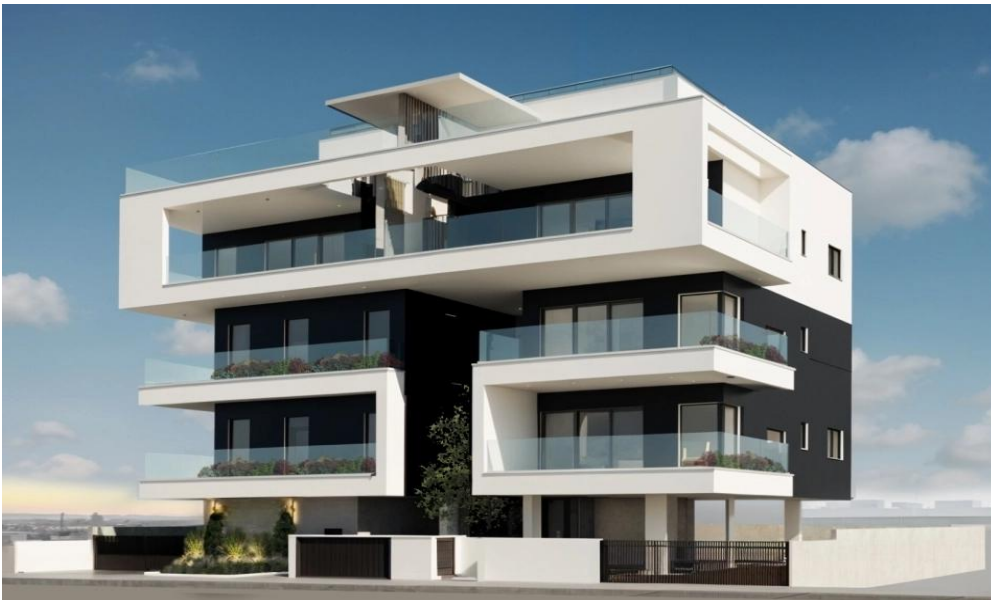
3rd Floor & Roof Garden