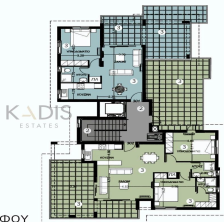
ΚΑΤΟΨΗ ΤΡΙΤΟΥ ΟΡΟΦΟΥ