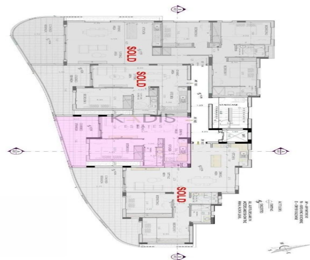
ΚΑΤΟΨΗ 1ΟΥ ΟΡΟΦΟΥ