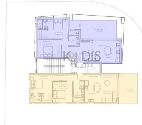
Κατόψη 4ος όροφος