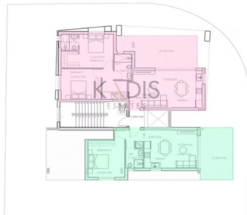
Κατόψη 5ος όροφος