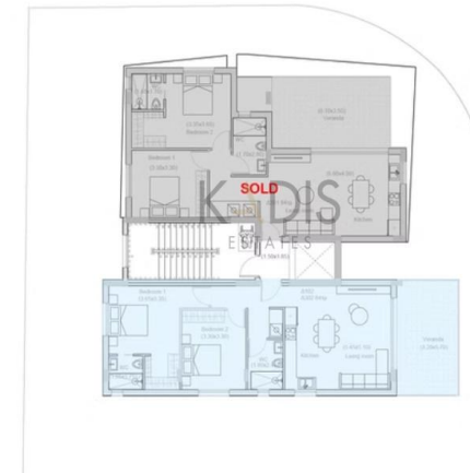
Κατόψη 3ος όροφος