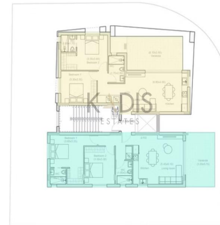
Κατόψη 1ος όροφος