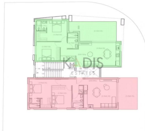
Κατόψη 2ος όροφος