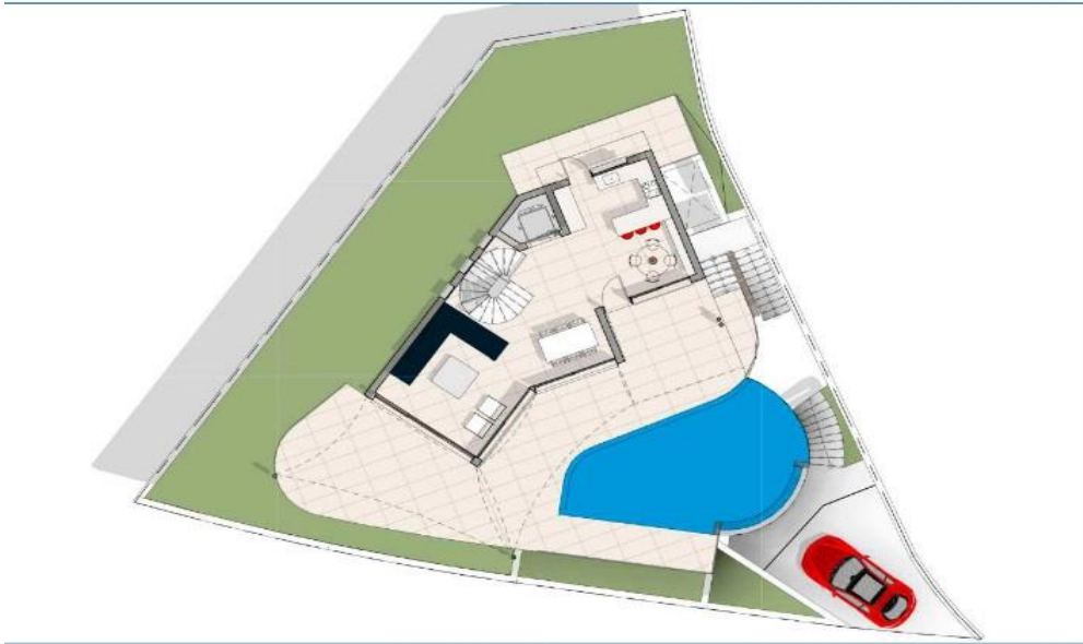
PRELIMINARY SITE PLAN