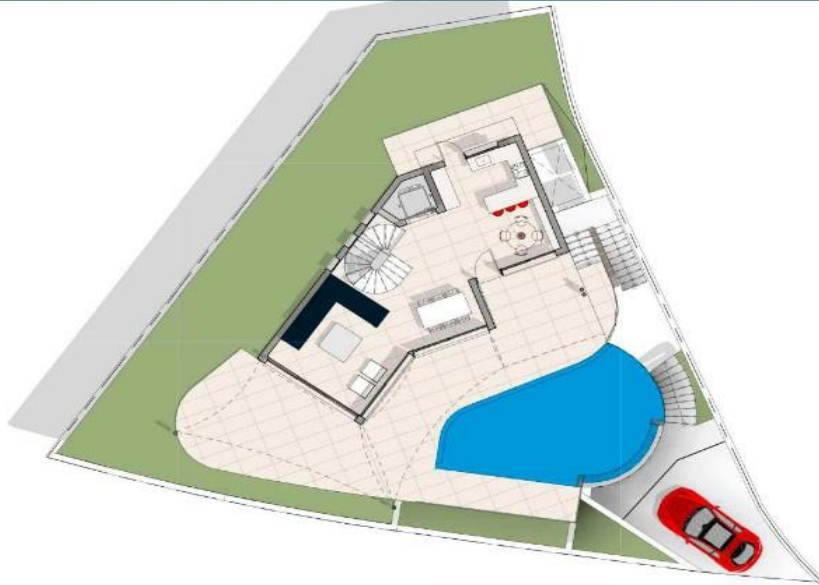
PRELIMINARY SITE PLAN