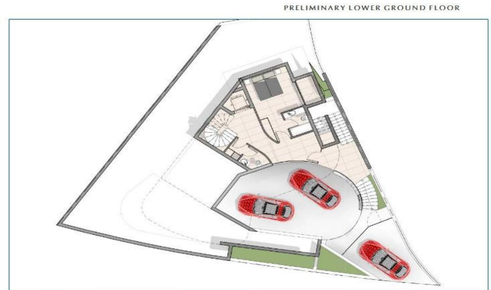
PRELIMINARY LOWER GROUND FLOOR