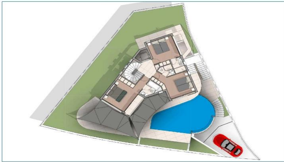
PRELIMINARY FIRST FLOOR