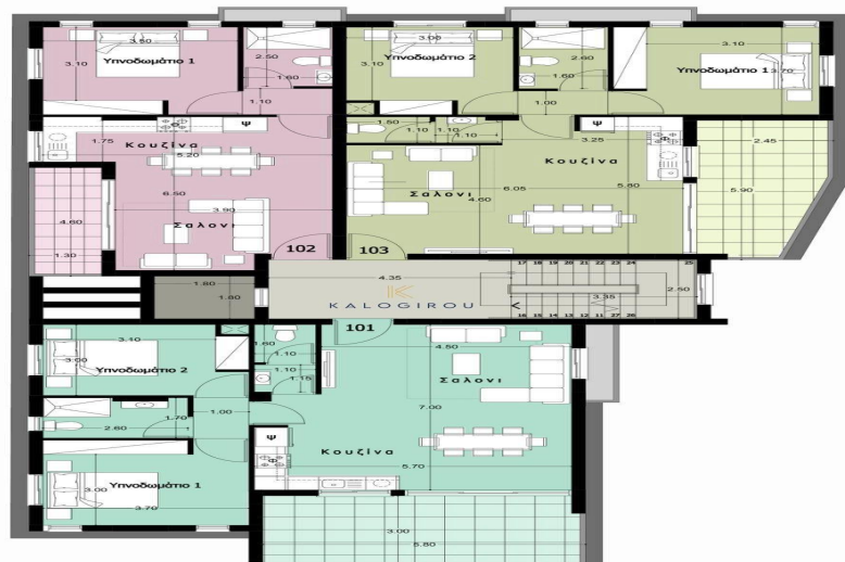
ΚΑΤΟΨΗ 1ΟΥ ΟΡΟΦΟΥ