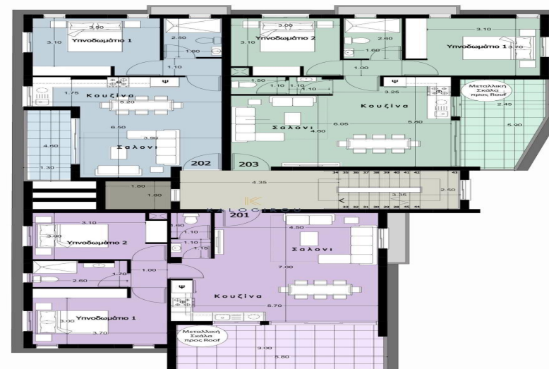
ΚΑΤΟΨΗ 2ΟΥ ΟΡΟΦΟΥ