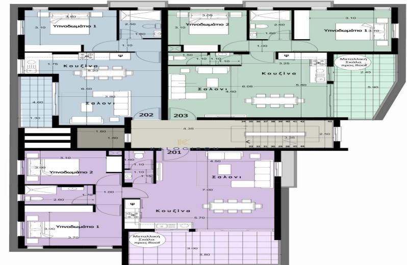
ΚΑΤΟΨΗ 2ΟΥ ΟΡΟΦΟΥ