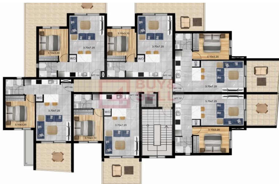
FIRST FLOOR PLAN FLAT 101