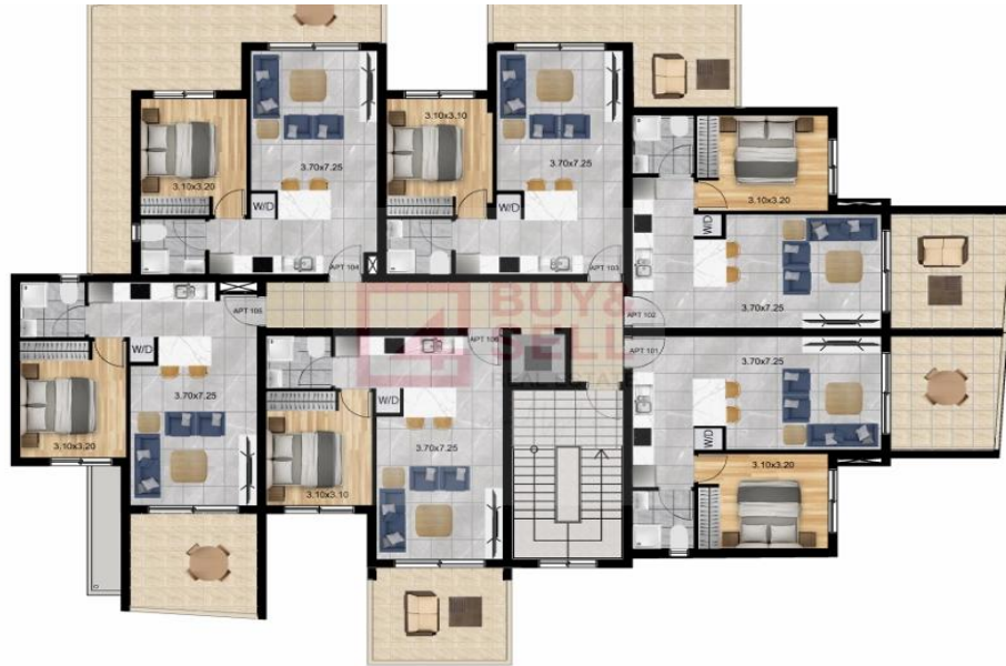
FIRST FLOOR PLAN FLAT 101