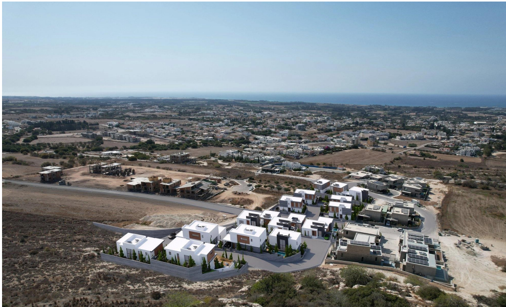
PLOT 8 300 m 2