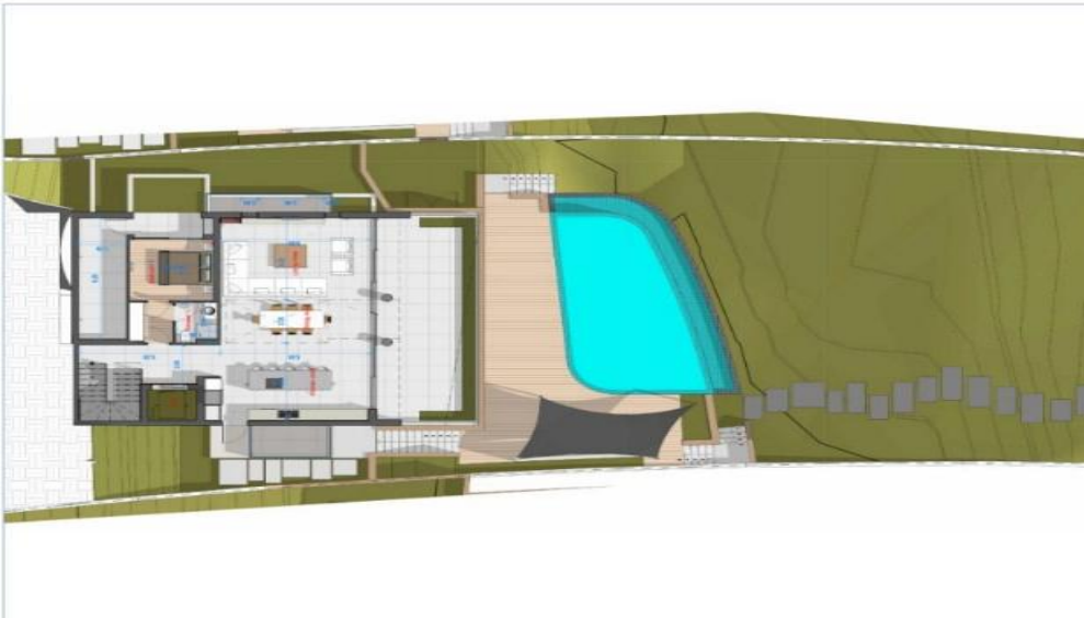
PRELIMINARY GROUND FLOOR PLAN