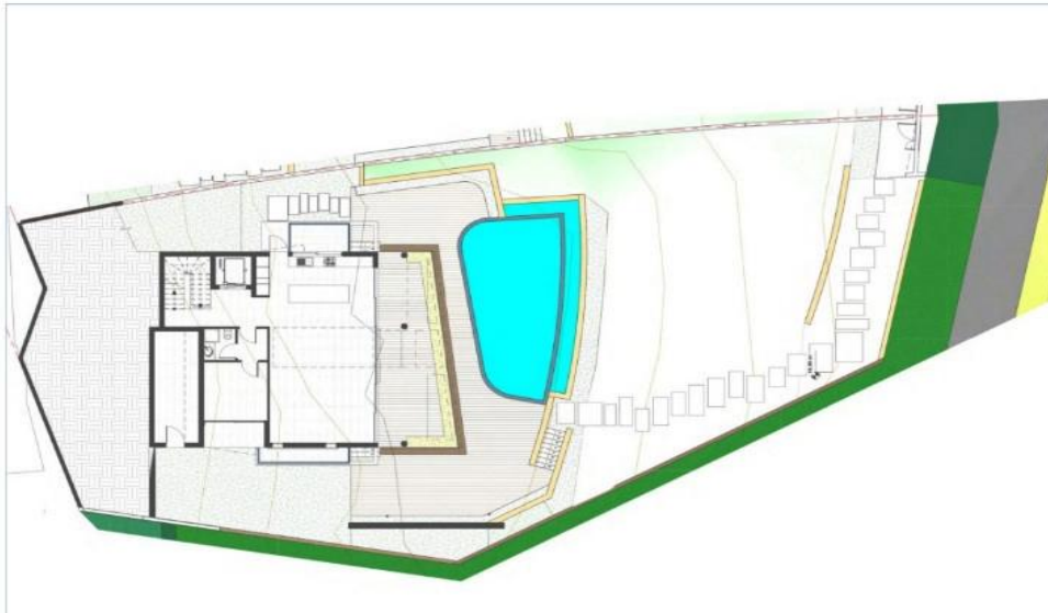
PRELIMINARY FIRST FLOOR PLAN