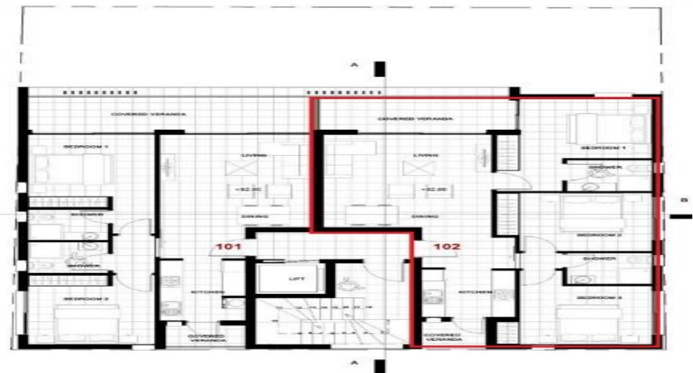
PRELIMINARY FIRST FLOOR PLAN