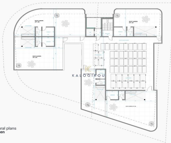
Architectural plans Roof garden