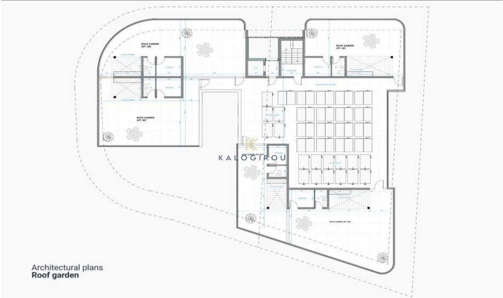
Architectural plans Roof garden