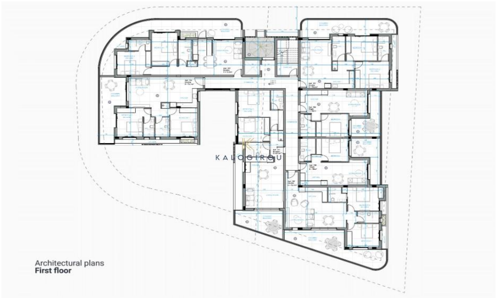
Architectural plans First floor