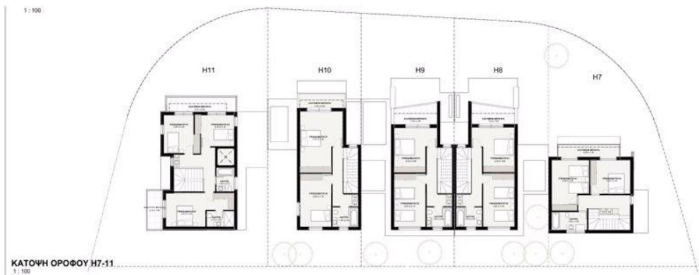
ΚΑΤΩΦΗ ΟΡΟΦΟΥ Η7-11