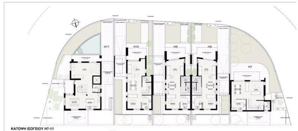
ΚΑΤΩΦΗ ΙΣΟΓΕΙΟΥ Η7-11