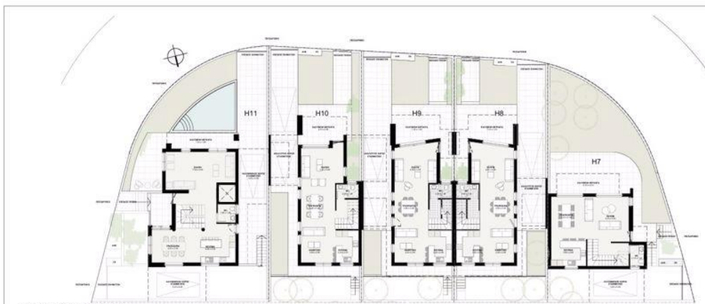
ΚΑΤΩΗ ΙΣΟΓΕΙΟΥ Η7-11