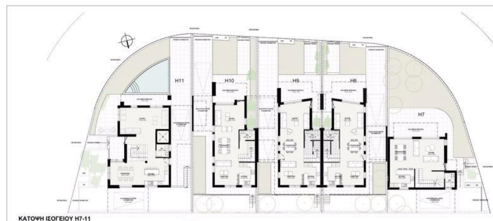
ΚΑΤΩΦΗ ΙΣΟΓΕΙΟΥ Η7-11