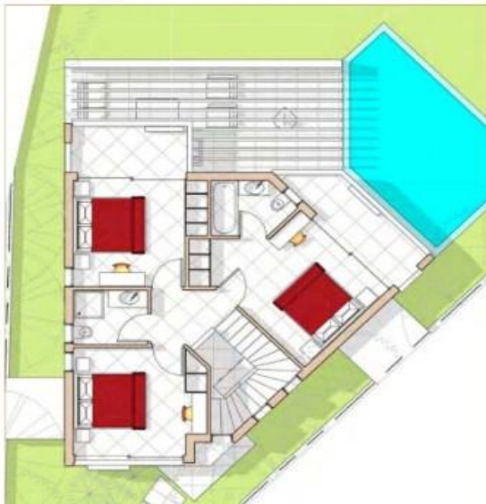
PRELIMINARY FIRST FLOOR PLAN