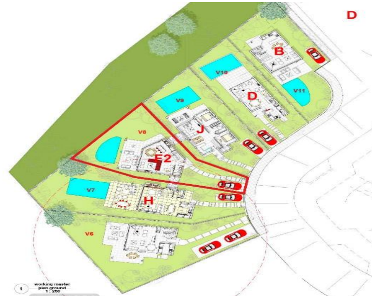
working master plan of district 1:5200