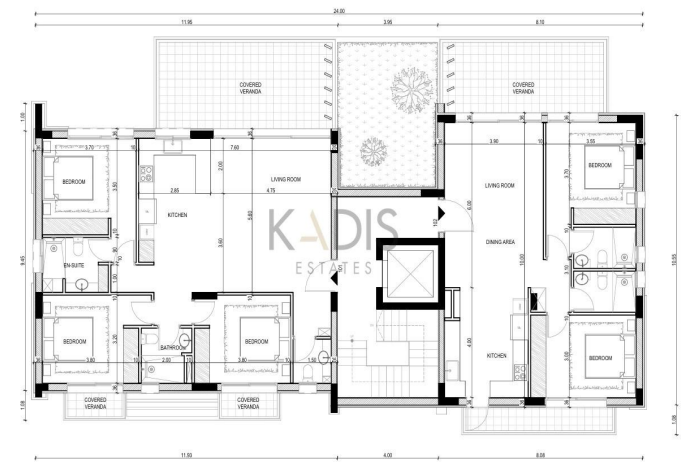
EXISTING FIRST/SECOND FLOOR