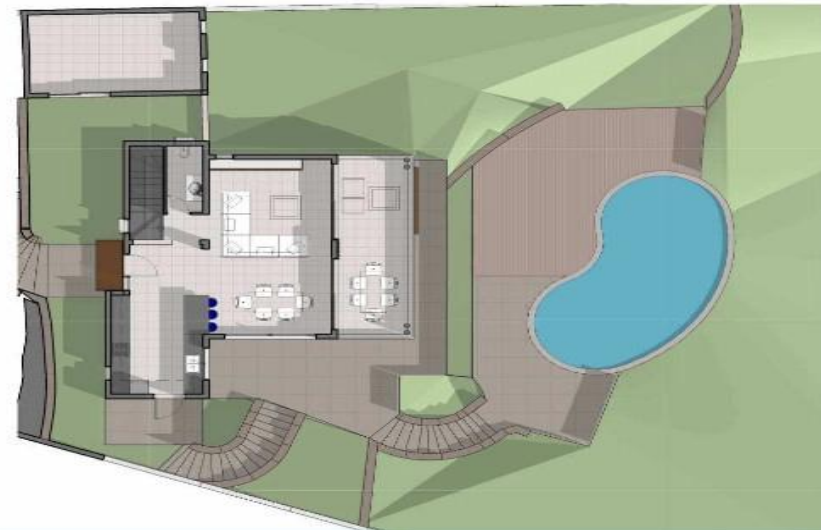
PRELIMINARY LOWER GROUND FLOOR PLAN