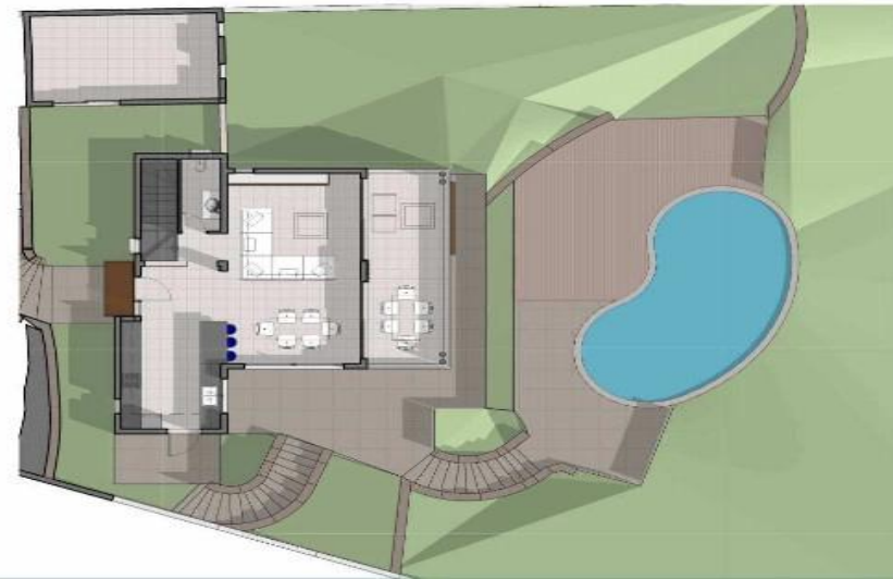
PRELIMINARY LOWER GROUND FLOOR PLAN