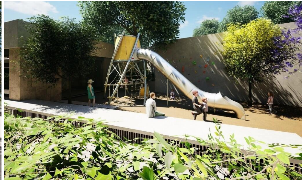
TYPE 02 ROOF GARDEN