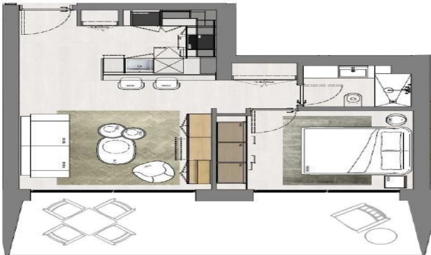
ONE-BEDROOM APARTMENT Typical Lower Floor Type D

APARTMENT AREA 58 M 2 COVERED VERANDA 20 M 2