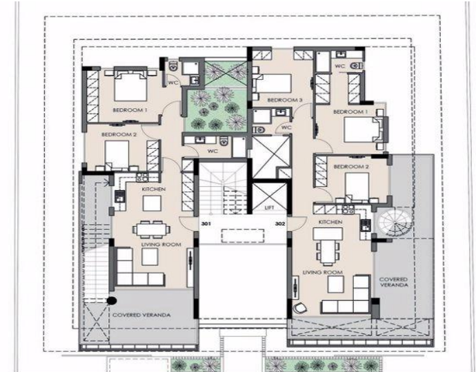
FLOOR PLANS THIRD FLOOR