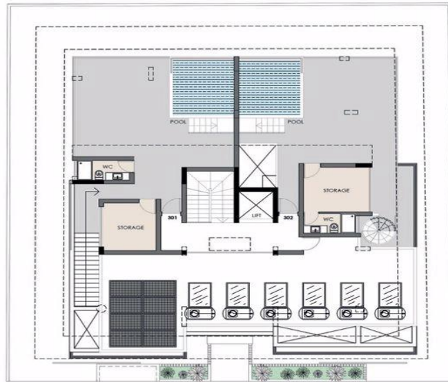
FLOOR PLANS ROOF GARDEN