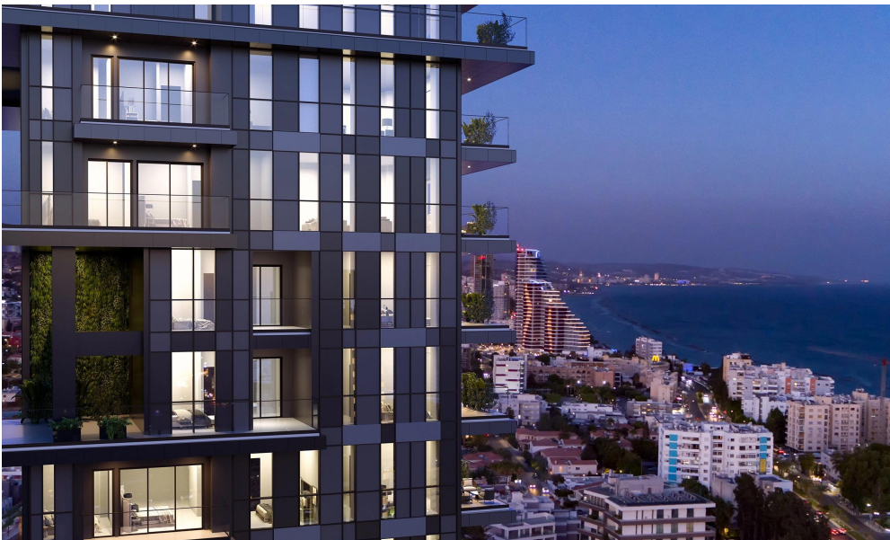
Apartments 4 th & 15 th