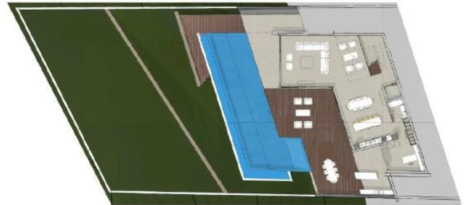
PRELIMINARY SITE PLAN