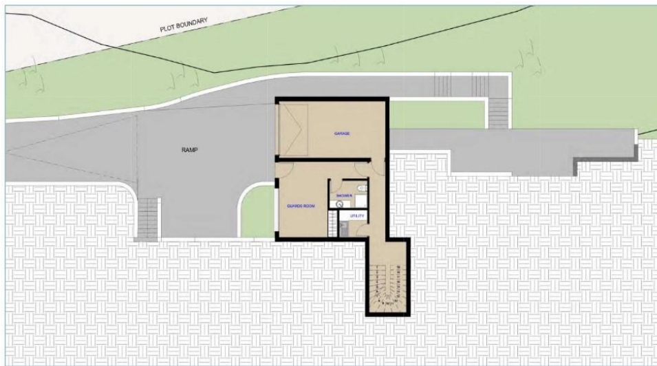
PRELIMINARY SITE PLAN