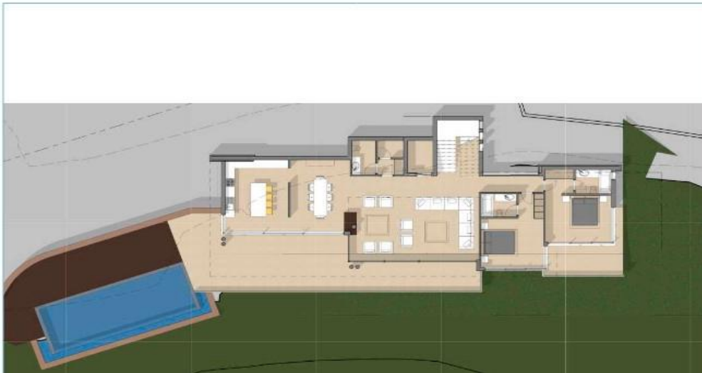
PRELIMINARY SITE PLAN