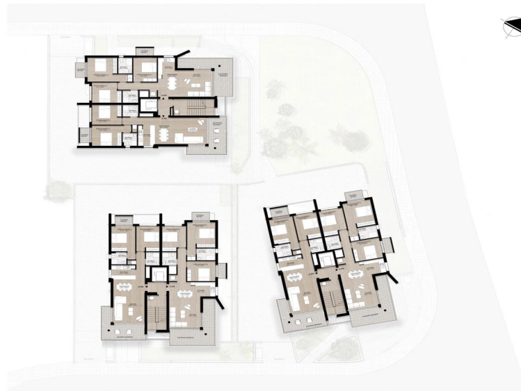
ΚΑΤΩΦΗ 2ου ΟΡΟΦΟΥ