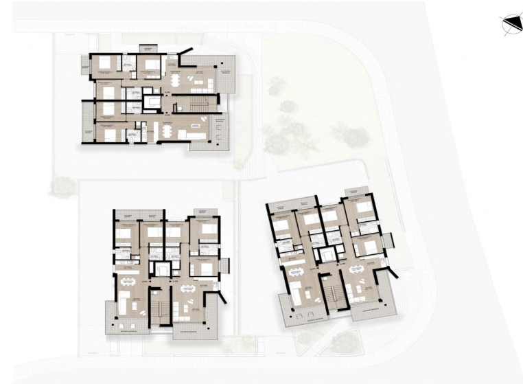
ΚΑΤΩΦΗ 1ου ΟΡΟΦΟΥ