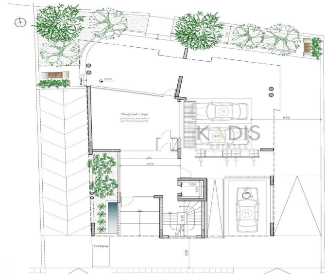
FLOOR PLANS [Ground Floor]