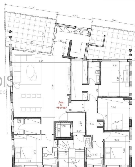
FLOOR PLANS [1st-4th Floor] - 4 BEDROOMS FLATS