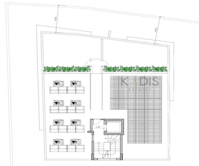
FLOOR PLANS [Roof]