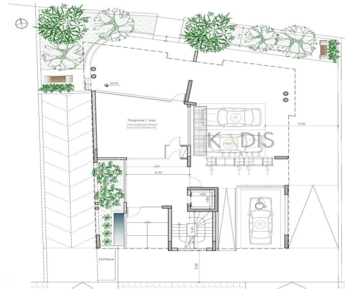
FLOOR PLANS [Ground Floor]