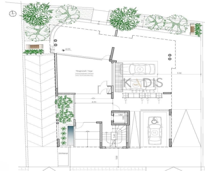
FLOOR PLANS [Ground Floor]