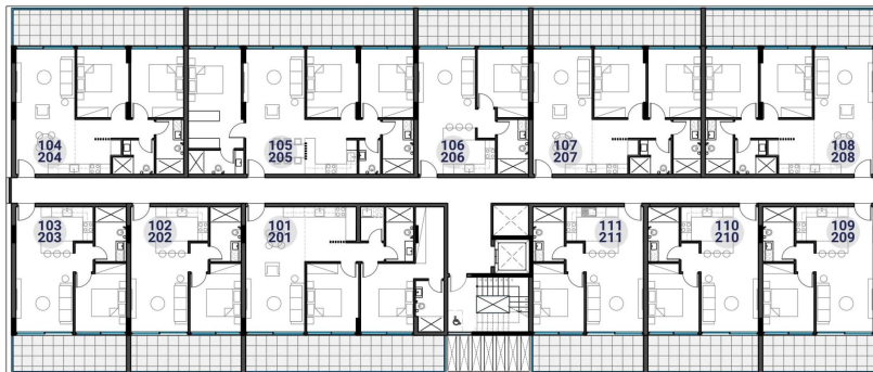
BLOCK B1 . C1 . C2 . C3 1ST & 2ND UPPER FLOORS