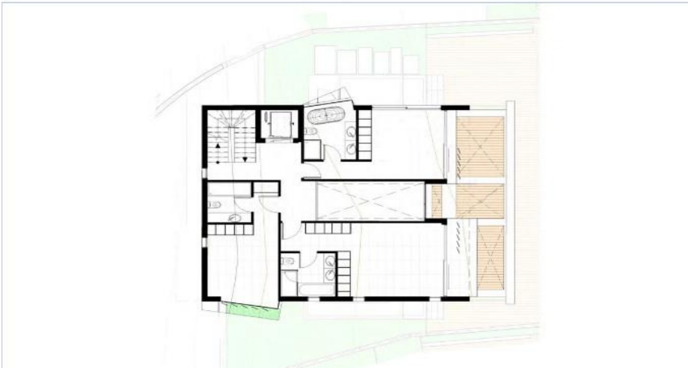
PRELIMINARY FIRST FLOOR PLAN