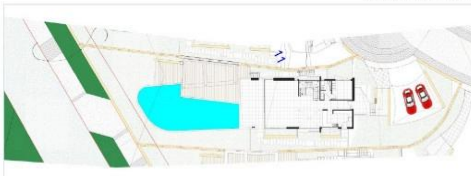
PRELIMINARY GROUND FLOOR PLAN