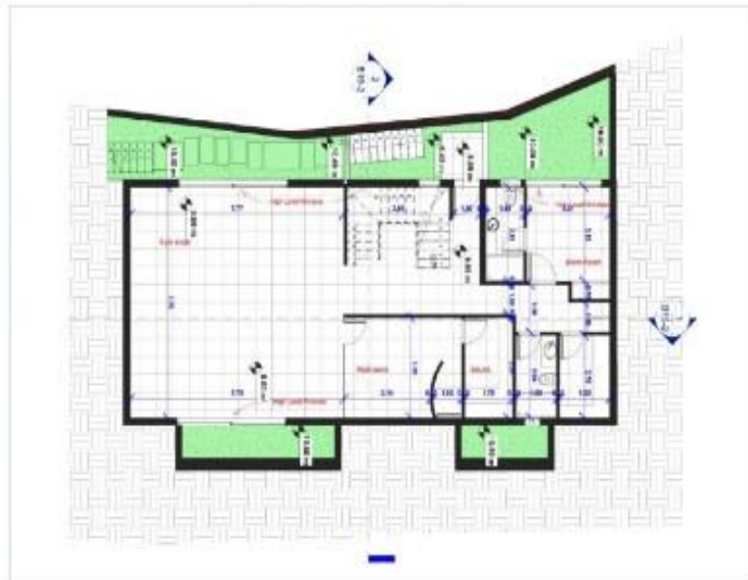
PRELIMINARY LOWER GROUND FLOOR PLAN