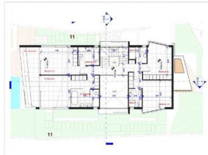
PRELIMINARY FIRST FLOOR PLAN