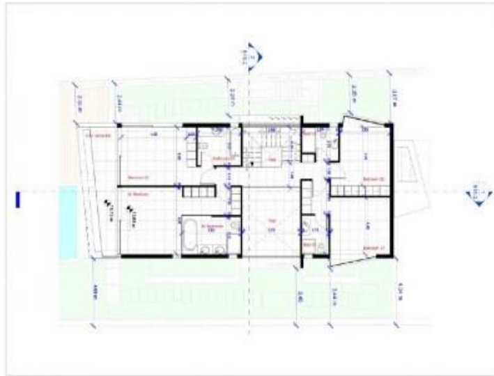
PRELIMINARY FIRST FLOOR PLAN